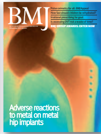
10 December 2011