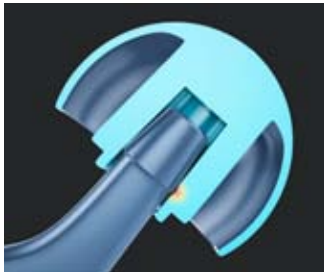
Large diameter metal-on-metal hip implant highlighting wear pattern caused by toggling on models with short tapers