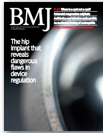
21 May 2011