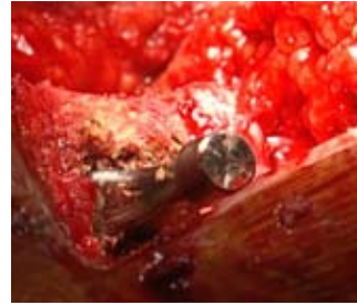
Cobalt-chromium implants can release metal ions. These can seep into local tissue causing reactions that destroy muscle and bone and leaving some patients with long term disability